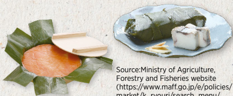
Source: Ministry of Agriculture, Forestry and Fisheries website ( https://www.maff.go.jp/e/policies/market/k_ryouri/search_menu/2702/index.html )

Traditional Japanese sweets, or wagashi , encompass an extensive range, from meticulously crafted seasonal delicacies resembling works of art as well as everyday treats available even in supermarkets. Primarily crafted from wholesome ingredients like rice and beans, wagashi offers a healthy indulgence. Try your hand at wagashi -making at one of the many programs throughout Japan.