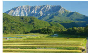
Daisen-Oki National Park