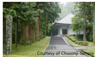
Konjikkido (Golden Hall), Chusonji Temple (Hiraizumi)

■ = Cultural heritage sites ■ = Natural heritage sites